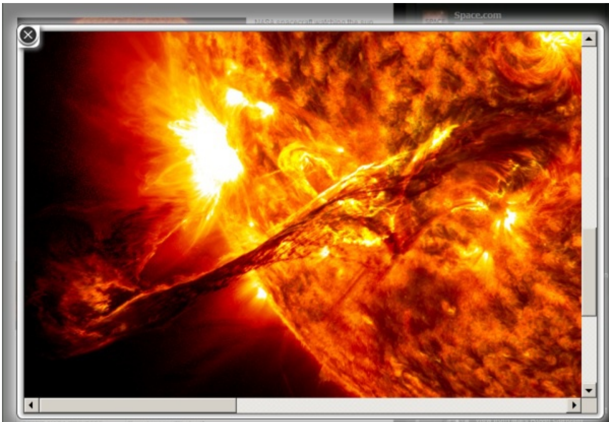
A filament exploding from the sun August 30 2012, followed by a CME millions of miles wide.

He said that in response to a statement I made, which was something like "from the bottom of my heart I wish more people would get away from all the idiocy on television and start looking at what's really happening. We've just missed the full impact of a solar flare that started as a filament that was 186,000 miles wide. That's 30 times bigger than the earth. And it expanded into a Coronal Mass Ejection that was many millions of miles across. "